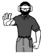
A. DO NOT PITCH