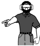
B. PLAY BALL